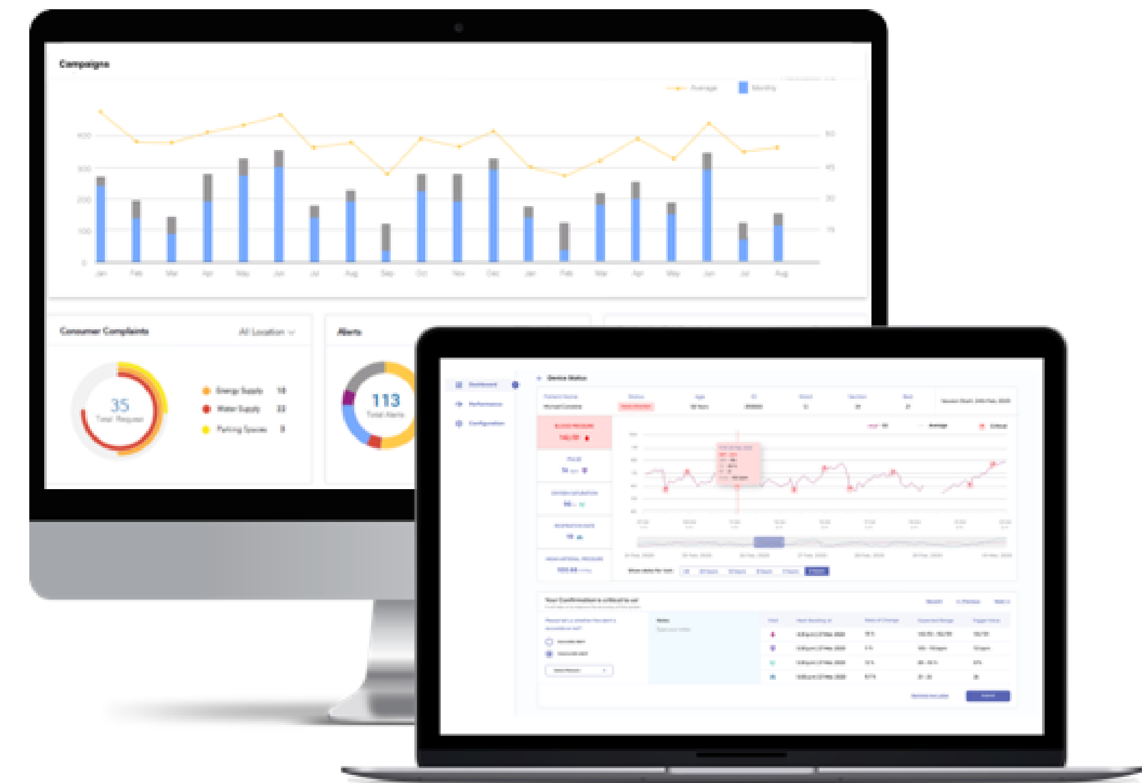
Risk detection dashboard with risk-based detection score and transparent results to enable timely report and intervention

Techolution's containerized solution architecture allows easy deployment on-prem & the cloud.